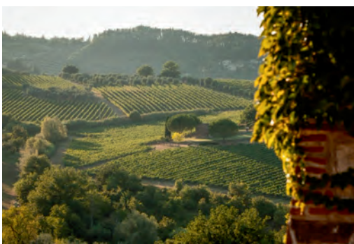
• Chianti's rolling vineyards