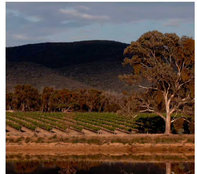
• Vineyards in the foothills of the Pyrenees