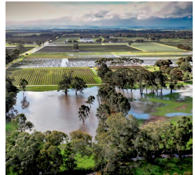
• The Bullant & Lake Breeze flooded vineyards

Langhorne Creek Wine Show '12, '13, '14, '16, '18