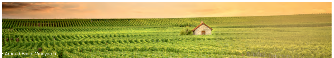
Arnaud Baillot Vineyards

*Limited availability, please contact your rep to secure an allocation