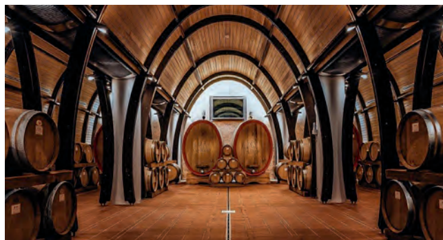
• The impressive cellar at Le Monde

Vigneti has 100ha of vineyards, up to 40 years of age, planted on its own 'Cru'. A unique rich combination of clay and limestone, which differ from the gravelly soils associated with the surrounding areas. In Friuli strict wine production techniques are still rooted in the local culture. This is invaluable for anyone who wants to produce high quality wines whilst respecting and getting the best from nature. The winery uses state-of-the-art technology that respects man and nature to consistently offer wines that are seductively simple and elegant.