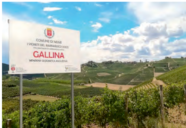
• Vineyards on the Gallina Hill, Comune di Neive, Piedmont