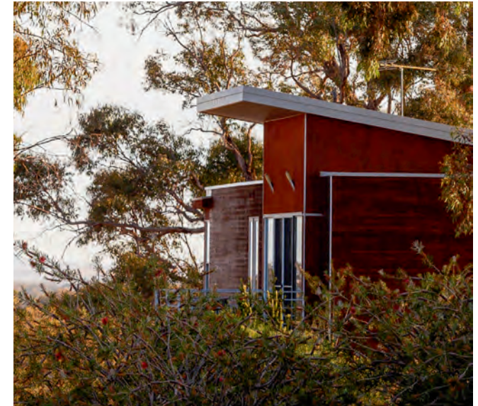
• Eco-Luxe Lodge nestled amongst 600 olive trees in the foothills at Mount Avoca overlooking the picturesque vineyard and Pyrenees Ranges