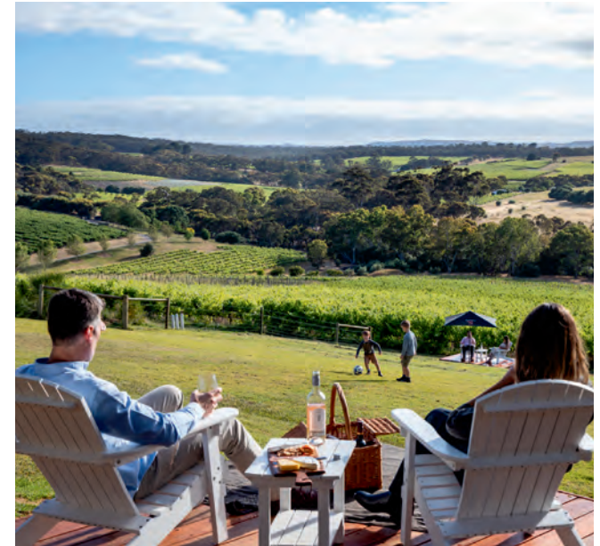
• The view from the Kay Brother's cellar door

This release represents a profound change at this address from a culture of rich wines hewn of old vines and traditional winemaking, at least in an Australian sense, to one of earlier harvesting and a grasp for freshness. Sure, the ancient vines remain. Yet despite the palpable intensity and drive, there is a twiggy dryness, a paucity of amplitude and a generosity that is synergistic with an early harvest window. Olive and dark fruits, sure. Time may bestow further beauty.