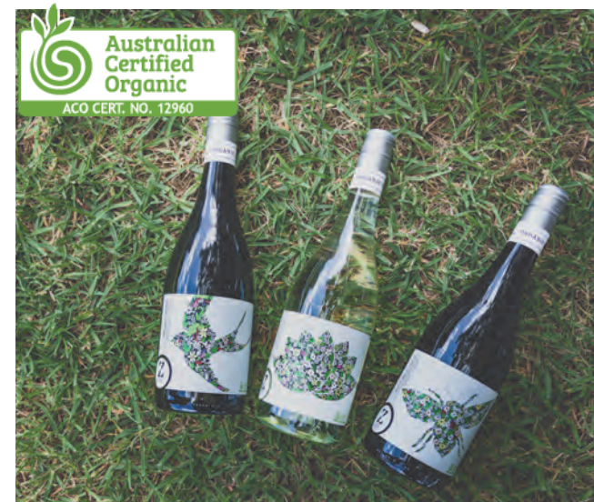
• Zonte's Footsteps range of organic certified wine – L-R Shiraz, Viognier, and Tempranillo.