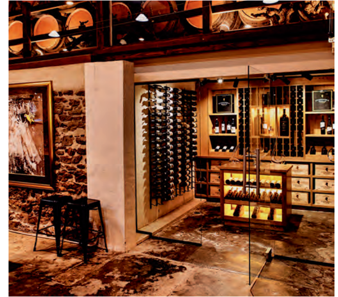
• Peter Lehmann Cellar Door, Tanunda, Barossa Valley