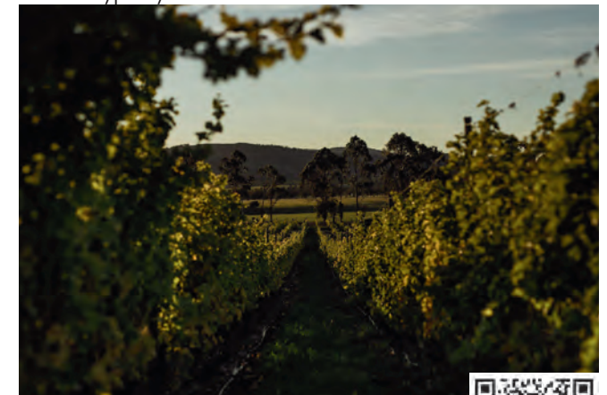
• Stoney Vineyard, Coal River Valley