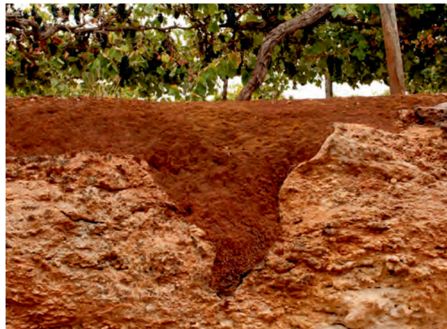
• Terra Rossa soil profile, red clay rich in iron oxide over limestone