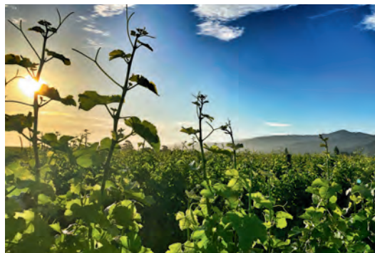
• Views from the vineyard.