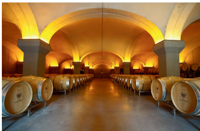
• Pico Maccario barrel hall, located in Monferrato, Italy

Pico Maccario own the largest single vineyard in Monferrato, a 70 hectare estate planted by grandfather Carlo. Planted to Barbera, Cortese, Moscato d'Asti, the clay based, medium textured soils allow for balanced, modern wines. Ageing in stainless steel and bottle allows them to show distinct expression of the varietal characters of the grapes and terroir. In Langhe, they have 12 ha of vineyards in the comune of Neive, Serralunga and Barolo including the prestigious Rionda and the Cannubi single vineyard which is recognized as the oldest in Italy dating back to 1752.