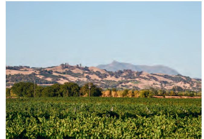
• Californian Vineyards