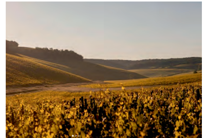
• The vineyards of Chablis at sunrise.