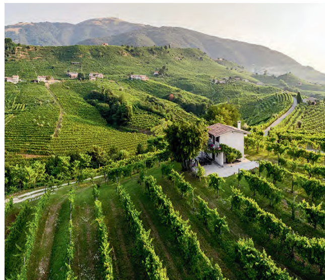
• The La Rivetta vineyard on the slopes of Valdobbiadene.

The overarching high quality of Prosecco built great confidence among consumers who might otherwise have been intimidated by sparkling wine. Gone are the days of Italian wines being almost exclusively served in Italian restaurants with Italian food. Because of its great versatility at the dinner table, people now realise what a great match Prosecco also is with Asian, Mexican and Modern Australian cuisine, just to name a few.