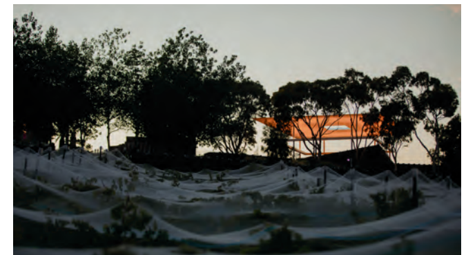
• Moorilla Vineyard the second oldest in Tasmania