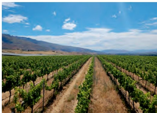
• Vineyards sit beneath the spectacular Pisa Ranges