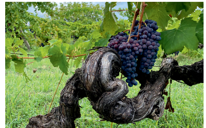
• Nerello Mascalese at Feudo Pignatone, towards the North of Etna