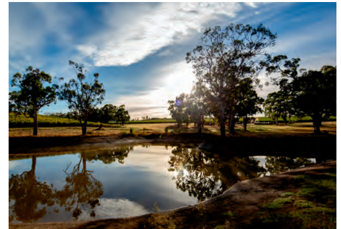
• Helen's Hill & Ingram Road vineyard in the Coldstream Hills.

The Yarra Valley was Victoria's first wine growing region with a history going back 170 years. It is divided into two sub regions. Valley floor and Upper Yarra. The Valley Floor includes Coldstream where the Helen's Hill & Ingram Road vineyard is located. Slightly warmer than its counterpart, vineyards on the valley floor are planted on rolling hills of predominantly sandy clay-loam soils with an elevation between 50 to 80 metres above sea level.