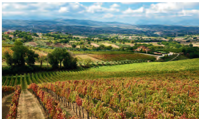
• The vines of Aglianico in the estate of Mirabella Eclano

Radici Taurasi is obtained by the union of precious selections of Aglianico grapes from the estates of Montemarano and Mirabella Eclano, the symbol product of classical viticulture signed Mastroberardino. Montemarano, with its 16 hectares, is a historic site in the production of Taurasi, located in the further south and higher area of the DOCG, from 500 to 650 metres above sea level.