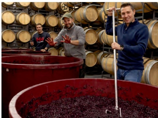
• Small batch, hands on winemaking with the team

Proelio is founded on the search for unspoiled areas worked the traditional way, with respect for the soil, which is the guiding principle of its wines. Proelio has found high-elevation cool-climate sites planted with old vines that are painstakingly tended to produce wines that are both unique and very much a reflection of this area in Rioja. Their work system is based on the characterisation and classification of the different vineyards according to the soil and the soil-plant relationship, with the viticulture tailored to the needs of each plot. In addition, the tireless search for small plots with special and distinct characteristics to produce unique wines is one of the strengths of Proelio. Genuine Rioja wines whose typicity is defined by nature and interpreted by humans.