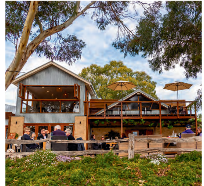
• Lake Breeze cellar door nestled amongst the vines in Langhorne Creek