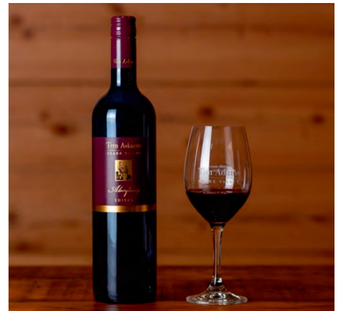
• The iconic Aberfeldy Shiraz – available giftboxed & in Magnums