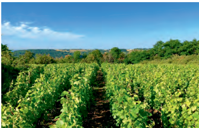
• Vineyards with a view in Bourgogne.

Pernand-Vergelesses – sitting at the northern end of the Côte de Beaune and is one of the most picturesque villages in Burgundy. Pleasant aromas of honey and honeysuckle evolve into exotic notes. A wine of character, energy and mineral notes. An intense, fruity and fresh aftertaste.