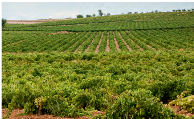
• 30 year old Tempranillo bush vines

This is a special selection of Tempranillo coming from the winery's favourite vineyard in El Provencio, Spain. Sitting at an elevation of 700m, the vineyard is home to 30 year old bush vines that provide outstanding quality year after year. Tempranillo from this site shows distinguished aromas of black cherry and blueberry jam, a juicy palate with vanilla, milk chocolate and coffee bean. It is dry, full bodied with ripe velvety tannins and a long finish. This wine is aged for a minimum of 6 months in French Oak.