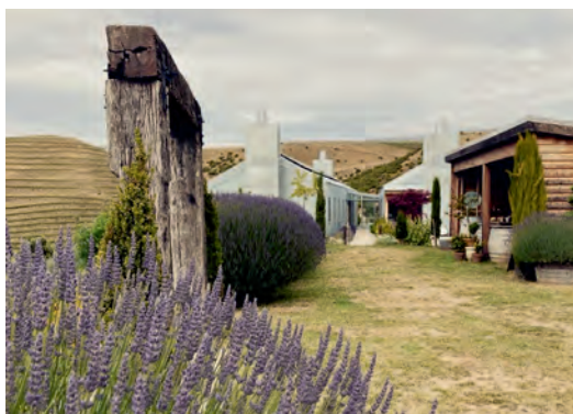
• Domaine Thomson architecturally designed cellar door

At 45° South, the spectacular site has been planted into 4 blocks each with their own characteristics. The plantings are on elevated north-east facing terraces in deep gravel with some loess and clay. The frost free, warm mesoclimate and free draining soils are ideal for growing Pinot Noir with excellent concentration and intensity of flavours.