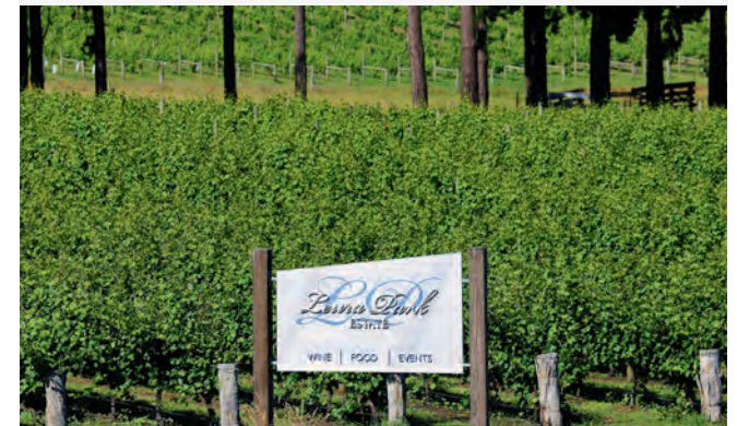
• Leura Park Estate cellar door sign in front of the vineyard.