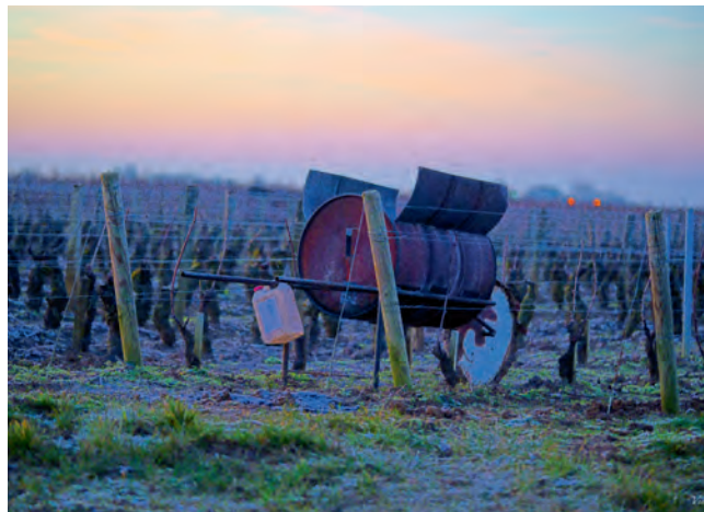
• Vines mid-winter near the village of Pernand-Vergelesses