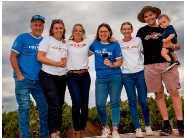
• The Ricca Terra Vintage Crew 2022

Harvey Norman/Delicious Magazine Produce Awards 2022