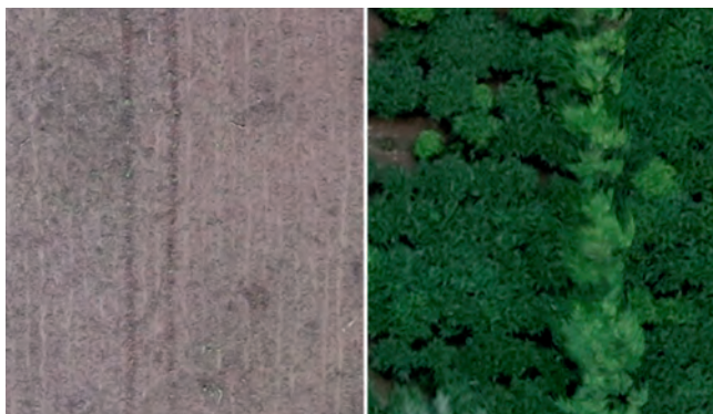
• 'Before' and 'After' Trees for The Future Food Forest, Senegal, Africa

The Red is 100% Tempranillo, with a small portion aged in oak. The nose shows sweet plum, cherry and cacao, flavours of berry fruit and a long soft finish.