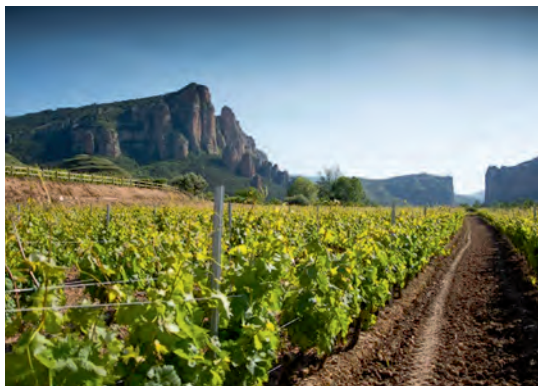
• Bodegas Proelio, Rioja