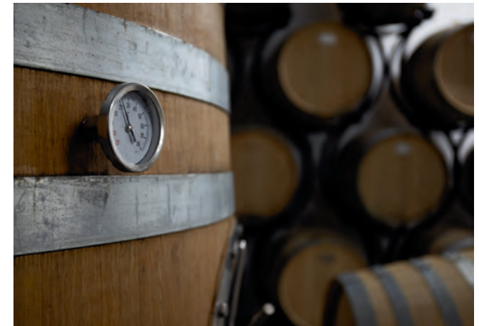
• Grand Cru Chablis is fermented in French oak foudre

Grand Cru Valmur – The Valmur terroir is split into two parts on each side of the Sainte-Vaubourg fountain path. Its clay limestone soils are deeper than the other Grand Crus. The slopes have a southerly exposure with chalky screes overlying fossilized oyster ‘Exogyra Virgula’ Kimmeridgian soil. Made from 55+ year old vines, an intense, concentrated and balanced mix of mineral and smoky flavours.