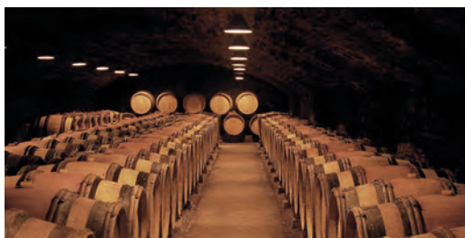
• Bouchard barrel cave.