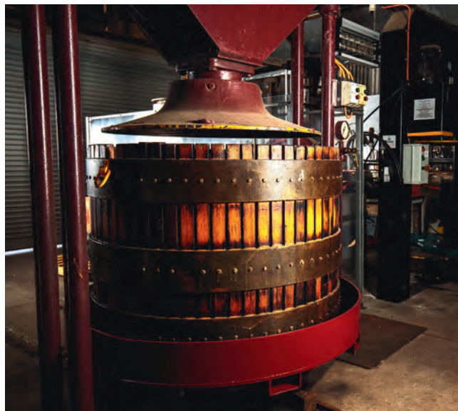
• Celestin Coq & Compagnie Basket Press in use since 1928