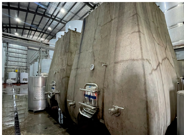
• Concrete tanks used to mature the ...ish range.

Made by owners Andrew Santarossa & Matt Di Sciascio, their minimal intervention winemaking style showcases the best each vineyard and varietal has to offer. In their drive to make the very best wines possible, the grapes are selectively hand harvested, whole bunch pressed, wild fermented with whole bunch/ carbonic fermentation and matured in concrete tanks.