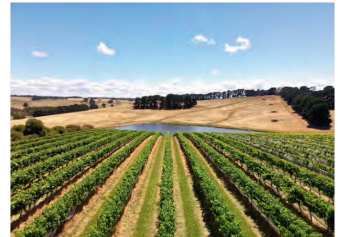
• Shiraz block looking towards the reservoir