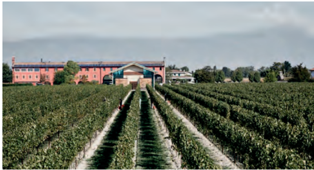
• The vineyards are protected by the alps to the northeast