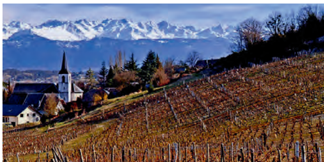
• Savoie Vineyards

Maison Varichon & Clerc was founded in 1901 in the town of Seyssel located in Savoie at the foot of Mont Blanc. It is one of the region's oldest and most important wine houses making Traditional Method sparkling wines. In 1996 became part of the Boisset Family of Wineries, with Boisset recognising the special attachment to Savoie and excellent quality of the wines.