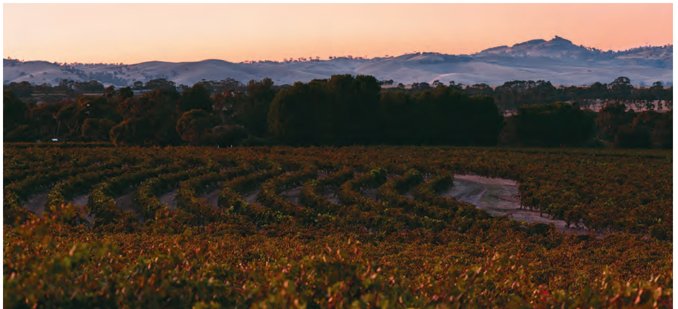
• Barossa Valley vineyards at sunset