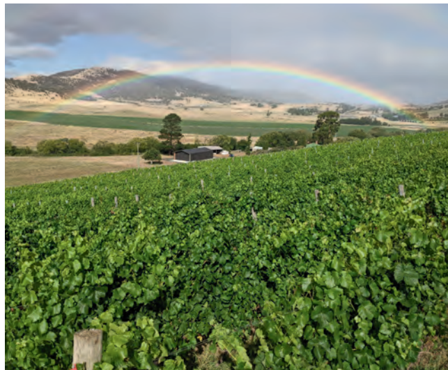
• The north-south row orientation Riesling vineyard.